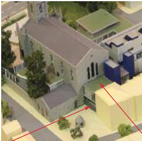
View from Old Street / Railway Avenue