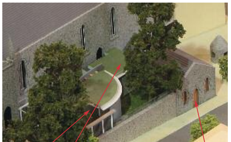
A view from Old Street Prayer Room Mortuary Chapel Refurbished Parish Hall