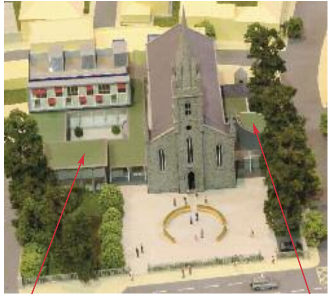
Front of Church from Main Street Parish Pastoral Centre Prayer Chapel